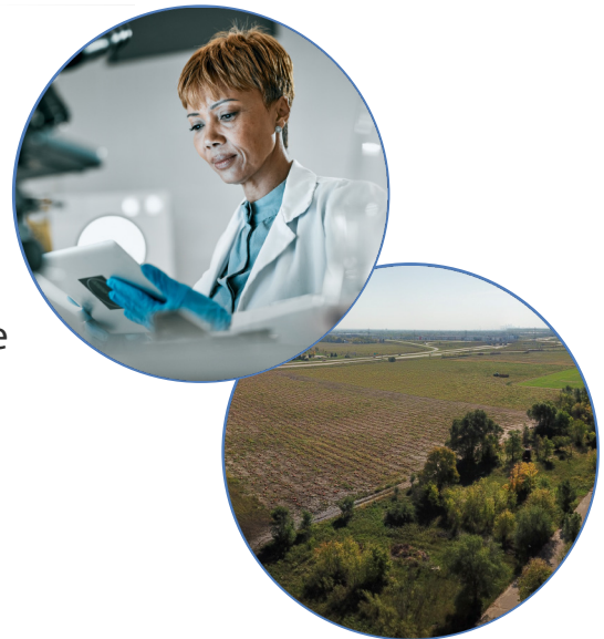
Brooklyn Park's 245-acre BioTech District is anticipated to grow over 10,000 jobs and 3,000 housing units.

However, Brooklyn Park needs concrete investment to build out infrastructure, bolster workforce development activities, and more, to make the District a reality.