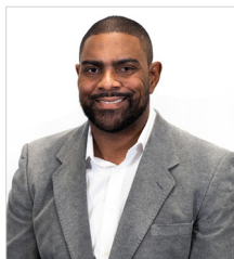
HOLLIES WINSTON Mayor (Elected through 2026)