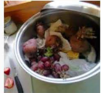
Bowl on your kitchen counter