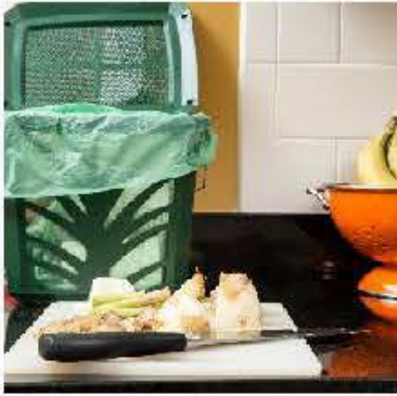
Countertop containers are convenient