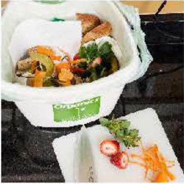
Small countertop container