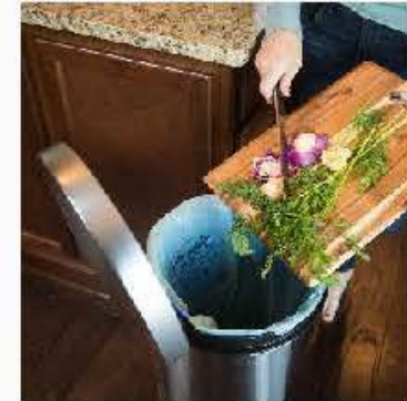
A larger container can hold more