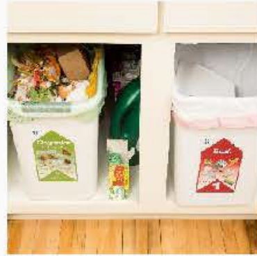
Under the sink is more hidden