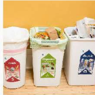
Paired with recycling and trash bins helps ensure things end up in the right place