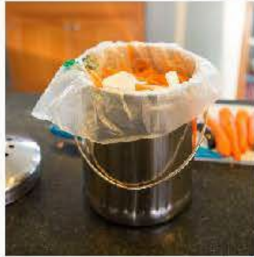
Fancier metal container