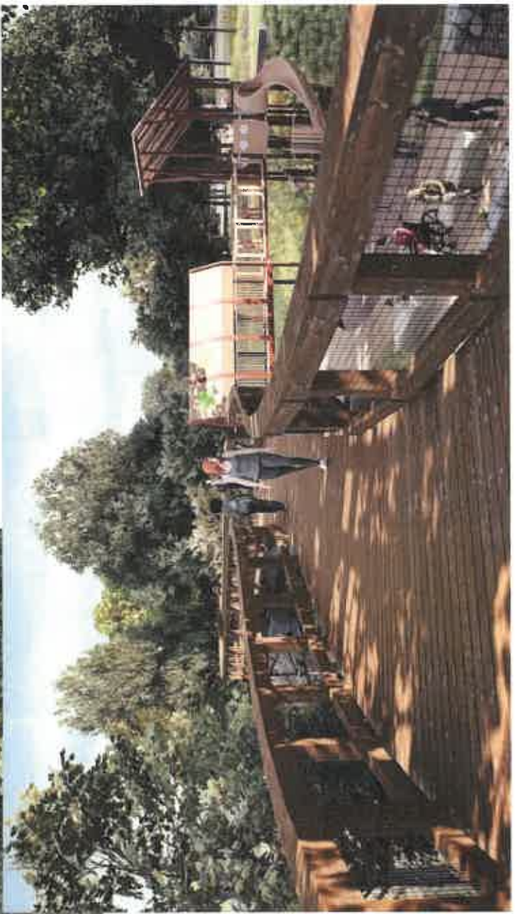
TREETOP TRAIL & NATURE PLAY