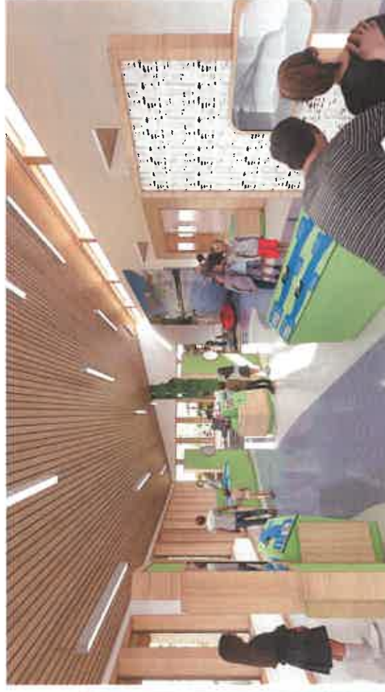
GATEWAY CENTER - EXHIBIT SPACE