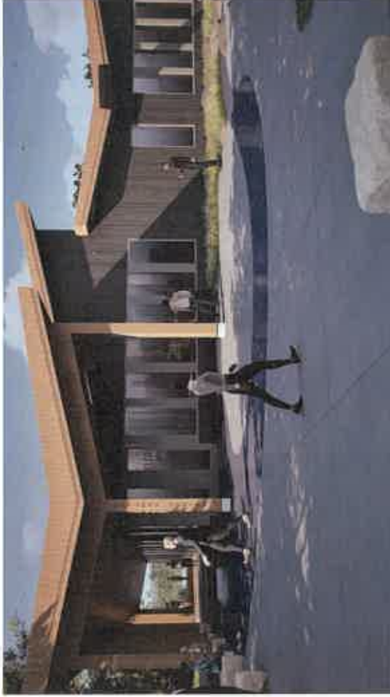
GATEWAY CENTER - MAIN ENTRANCE