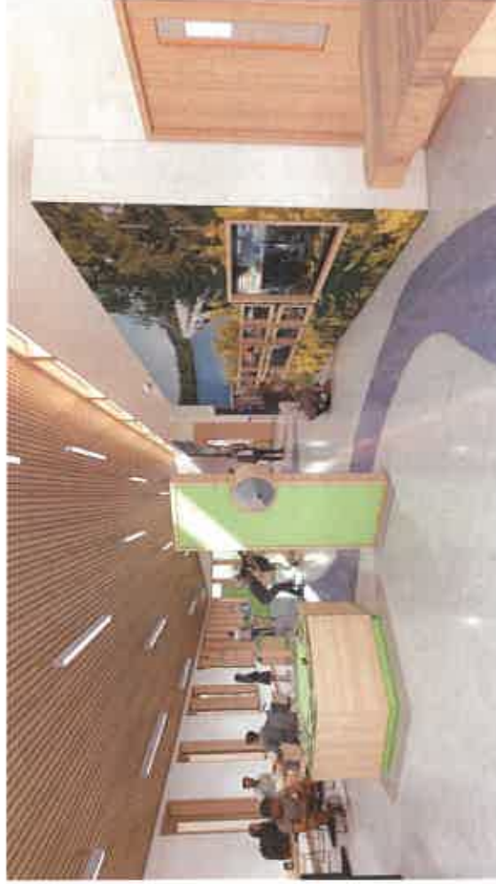
GATEWAY CENTER - EXHIBIT SPACE