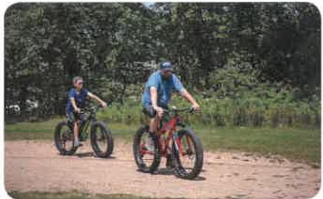
Mississippi Gateway Regional Park is envisioned as a stepping stone into nature. The intent is that the park will connect people to nature in a manner that they are comfortable ultimately transforming novice park visitors into environmental stewards.