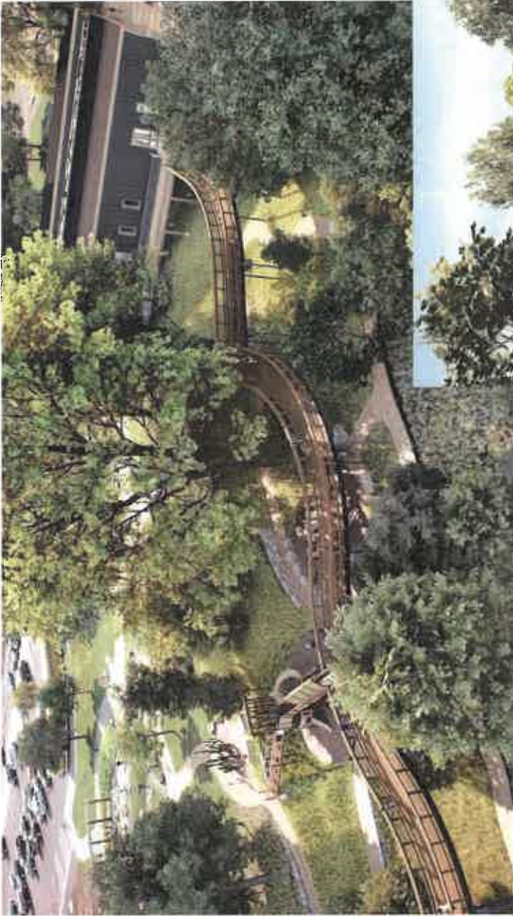
BIRD'S EYE VIEW - TREETOP TRAIL & NATURE PLAY