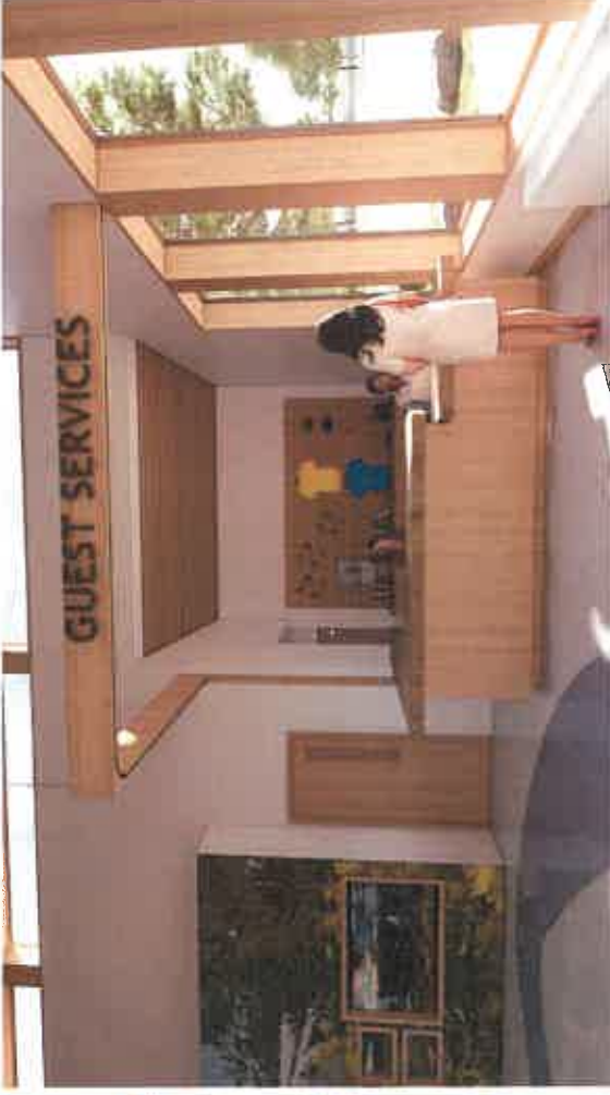
GATEWAY CENTER - RECEPTION