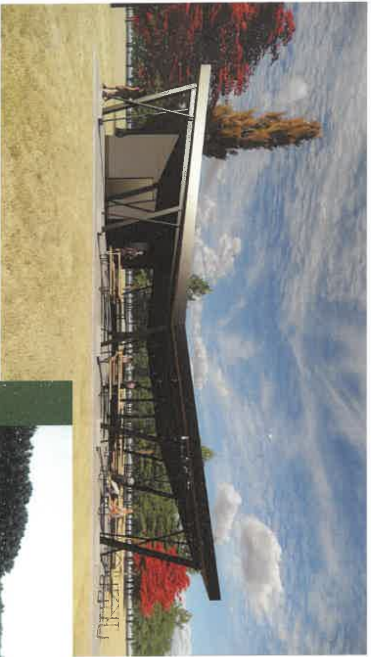
LARGE RESERVABLE SHELTER