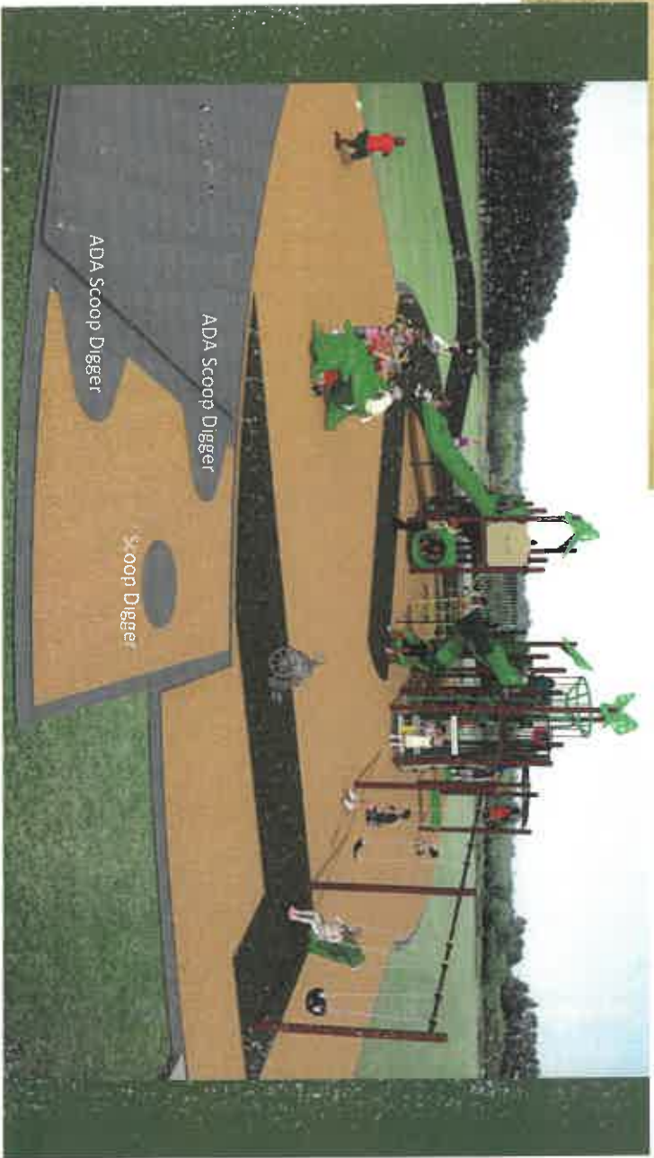
TRADITIONAL PLAY AREA