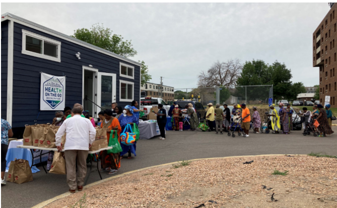
Health on the Go Senior Health Fair & Food Distribution