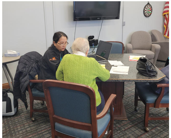
Senior Community Services: Technology Assistance