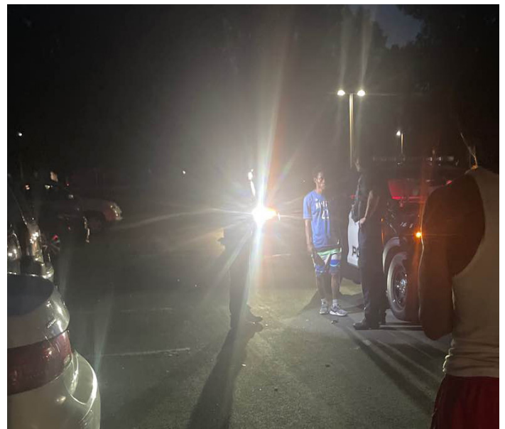
Violence Intervention Activities