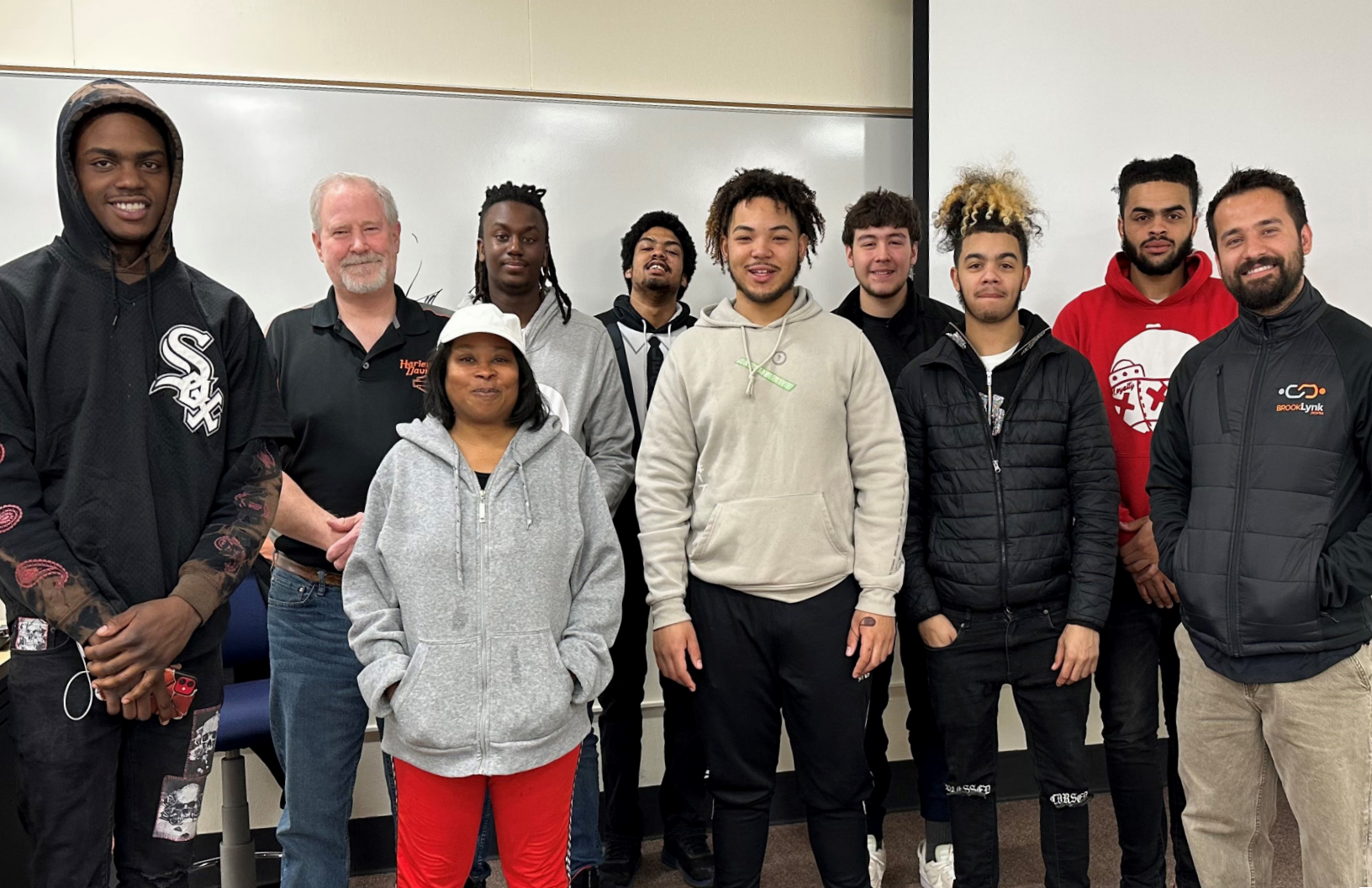
Above: BrookLynk Constructions & Trades Program Participants, 2023