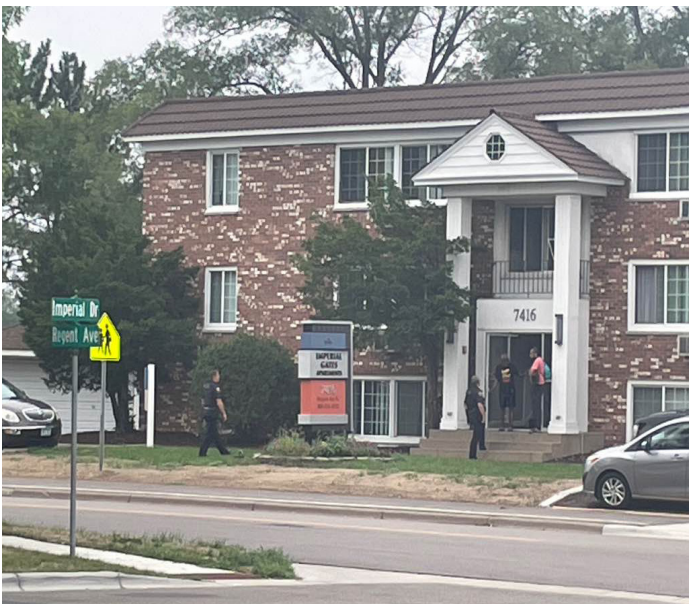
Violence Intervention Activities