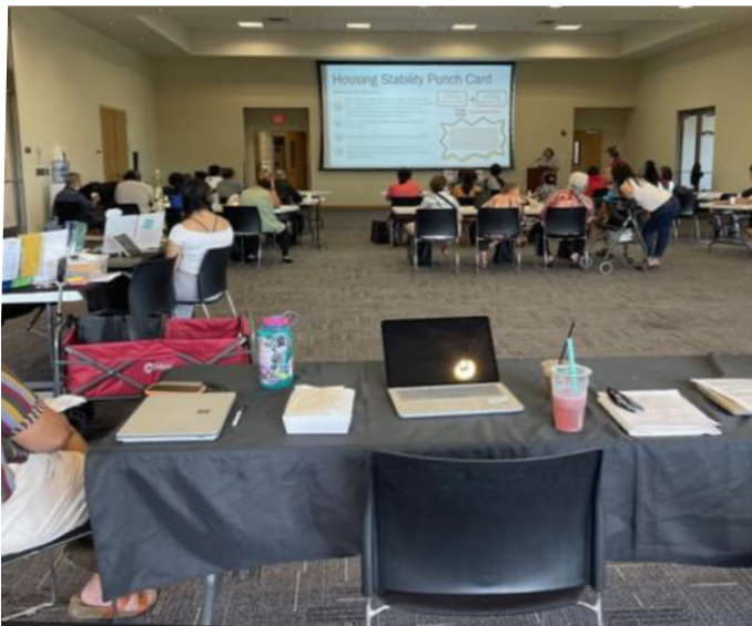
LACM: Housing Stability Event

During the summer of 2023, the City Council awarded ten high-performing organizations contract extensions to continue their work into 2024 and approved a second round of funding using a request for proposals process that resulted in funding for ten additional partner organizations. These organizations will provide support services to businesses and nonprofits, engage in workforce development activities, and provide basic support to community members.