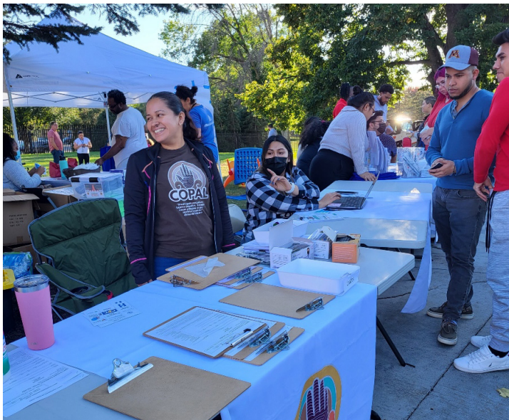
COPAL Community Outreach Event

“Funding from the City of Brooklyn Park allowed us expand services in the Brooklyns and engage over 7,000 LatinX Brooklyn Park residents to connect them with resources and COPAL’s services. We collaborated to host 5 COVID vaccine clinics and over 100 residents directly benefited from COPAL’s services.”