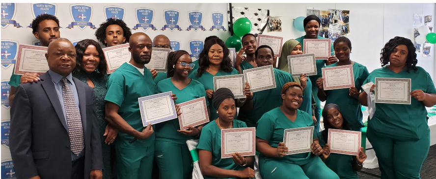
North Metro Certified Nursing Assistant Graduation