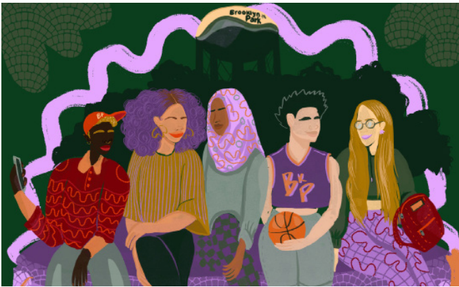
Brooklyn Bridge Alliance Anti-Hate art