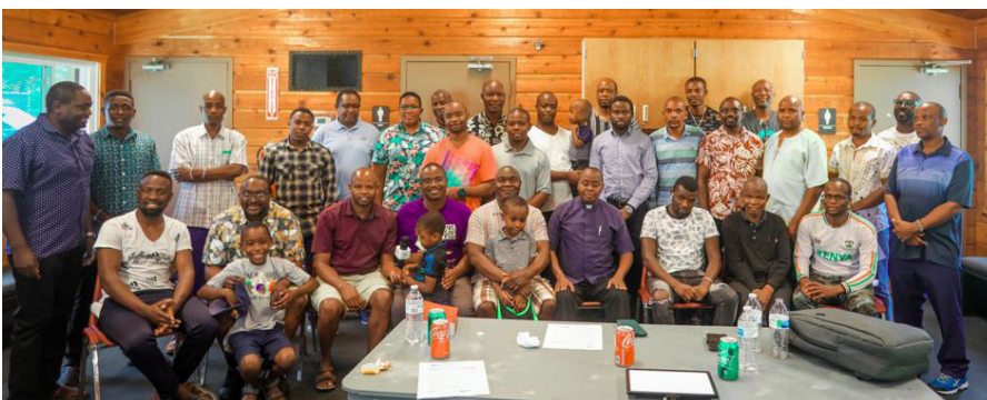
MN Kenyan Int'l Development Association (MKIDA) Mental Health Session