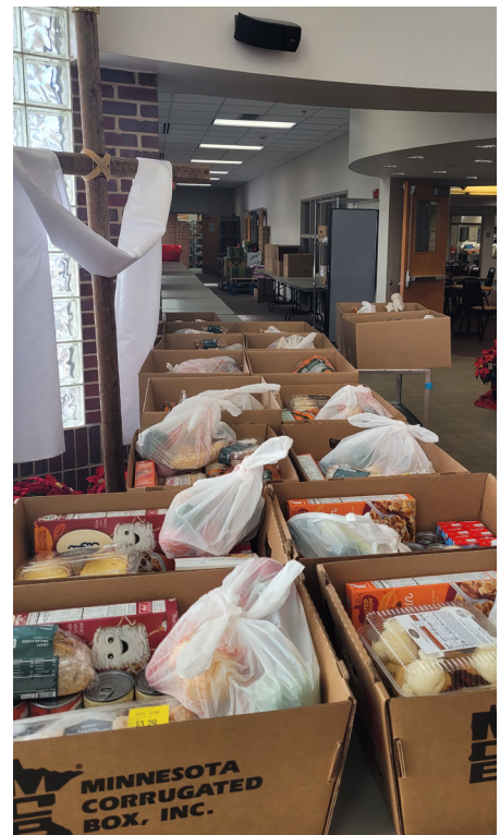
Salvation Army Food Distribution