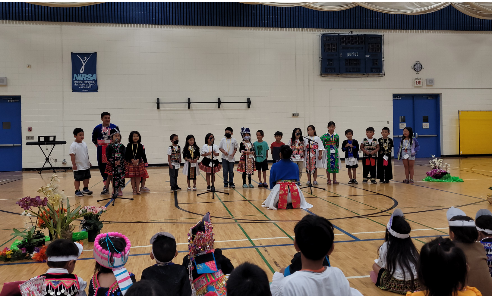
Above: MN Zej Zog Summer Camp Graduation