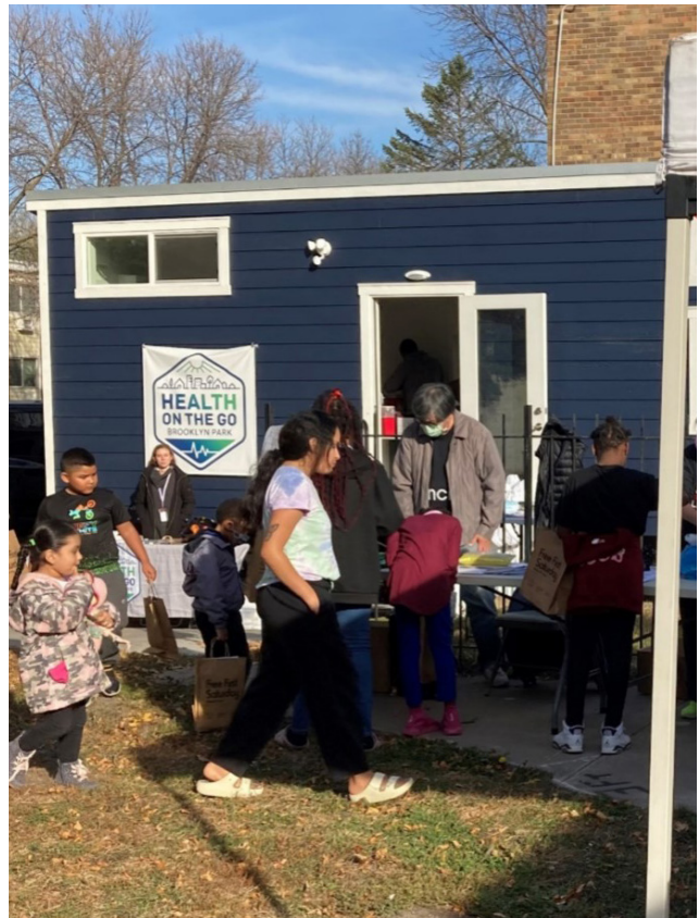
Health on the Go Event