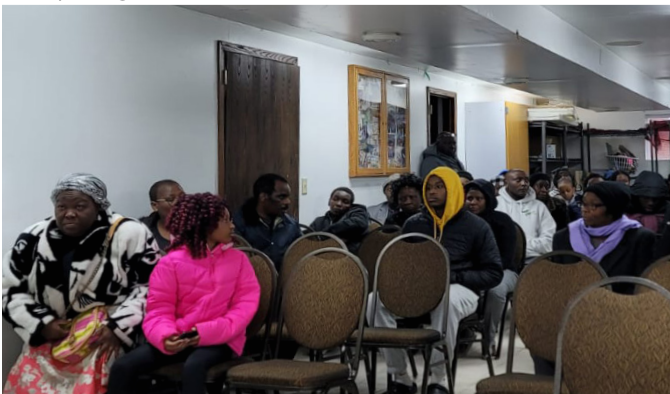
AMWAG Wellness Session