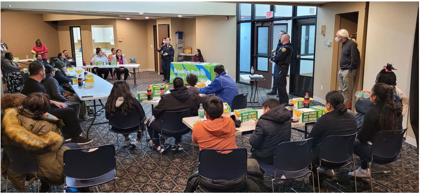
Police Intervention at Eden Park